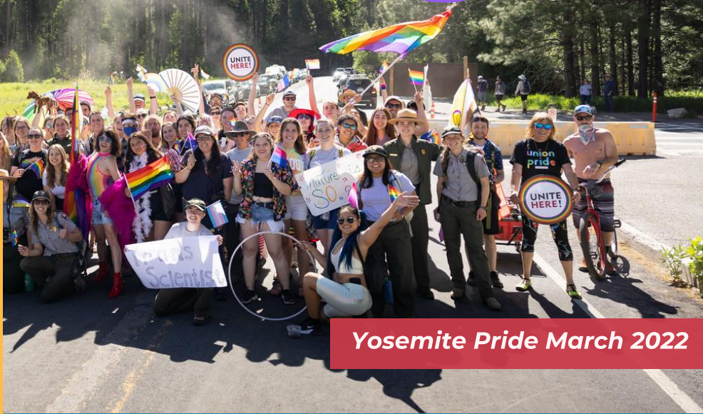
Yosemite Pride March 2022

"Lesbian, Gay, Bisexual, Transgender and Queer (LGBTQ) Pride Month is currently celebrated each year in the month of June to honor the 1969 Stonewall Uprising in Manhattan. The Stonewall Uprising was a tipping point for the Gay Liberation Movement in the United States. In the United States the last Sunday in June was initially celebrated as 'Gay Pride Day,' but the actual day was flexible. In major cities across the nation the 'day' soon grew to encompass a month-long series of events. Today, celebrations include pride parades, picnics, parties, workshops, symposia and concerts, and LGBTQ Pride Month events attract millions of participants around the world. Memorials are held during this month for those members of the community who have been lost to hate crimes or HIV/AIDS. The purpose of the commemorative month is to recognize the impact that lesbian, gay, bisexual and transgender individuals have had on history locally, nationally, and internationally." - Library of Congress